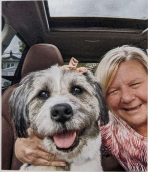
CHAR AND PRINCESS

Consistory is meeting on June 8th to discuss changes in our Covid policy. An email will go out with an update after that meeting. New details coming soon!