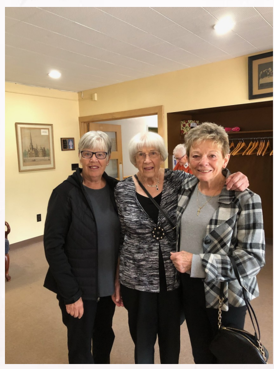
Trunk-or-Treat 2023 at Zion UCC!